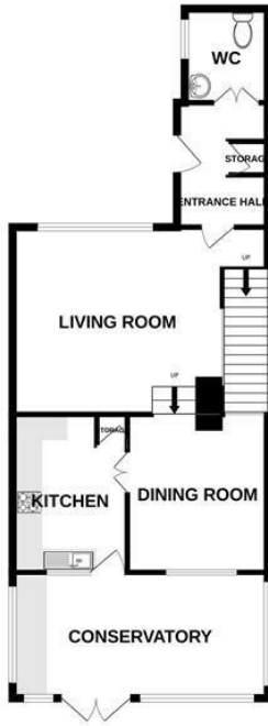
GROUND FLOOR 855 sq.ft. (79.4 sq.m.) approx.